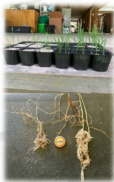
Without/With MM ( Zero Fertiliser)

Mineral Magic™ is Biogenic Amorphous Silica (BAS) and is both non-toxic and non-carcinogenic and a 100% natural mineral that has been over 125 million years in the making. From our mine in Western Australia's Northwest that is simply produced by crushing and screening the raw, mined product which requires the absolute minimum carbon footprint as opposed to the manufactured products that attempt to achieve the same benefits. Whether it be for the hydrophobic sand plains or the heavy clay-based soil, our Crop Starter can provide benefits to improve the soil structure, drought proofing and nutrient retention to improve quality crops whilst maximising your yield and return on investment.